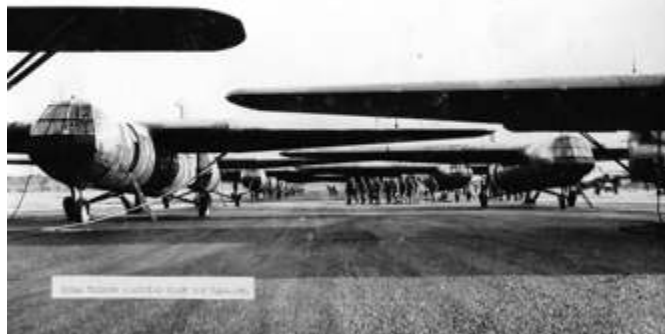
Horsa gliders lined up for take-off

Early the next morning (6 June) Down Ampney villagers awoke to see to their amazement that the sky was absolutely full of